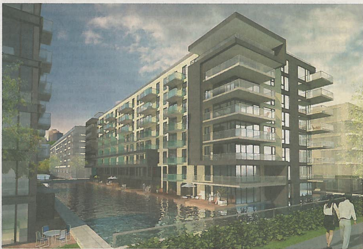
Bassins du Havre includes two-storey townhouse homes at ground level and mixed size apartments on the upper levels.