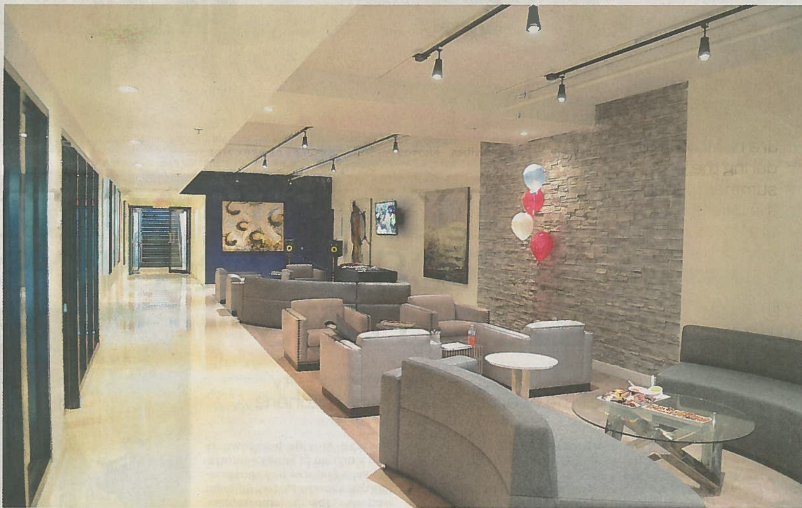
Condos Vue includes a large lounge with free Wi-Fi that serves as a family-friendly environment, drawing kids who hang out there after school with their laptops, doing homework.